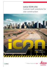
Leica iCON site Brochure