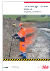
Leica iCON gps 70 Series Brochure

Illustrations, descriptions and technical data are not binding. All rights reserved. Printed in Switzerland – Copyright Leica Geosystems AG, Heerbrugg, Switzerland, 2024. 959264 en – 09.24