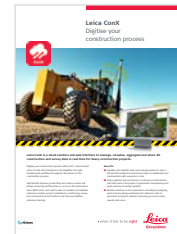
Leica ConX Flyer